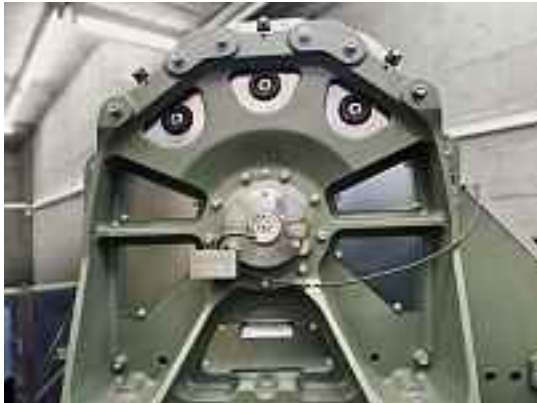
Safety included. State-of-the-art triple brake system.